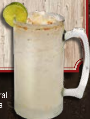
Agua Mineral Preparada