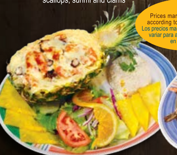
Pina rellena 18 99 Half pineapple stuffed w/shrimps, octopus, scallops, crab imitation, chopped pineapple & melted cheese

*MP Prices marked *MP may vary according to the current market Los precios marcados con *MP pueden variar para ajustarse a los costos en el mercado