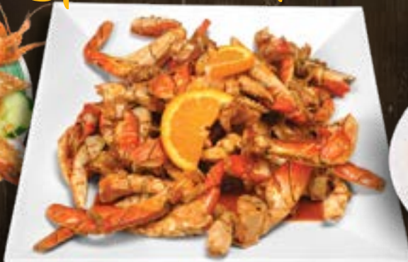
Patas De Jaiba Snow crab legs Nayarit style MARKET PRICE *MP