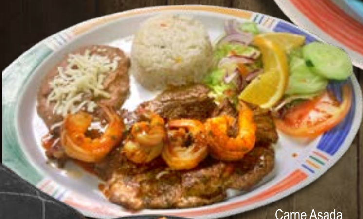
Carne Asada Con Camarones