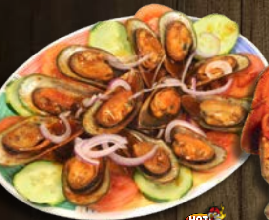
Charola de Mejillones Mussels (6) 6 99 • (12) 12 99