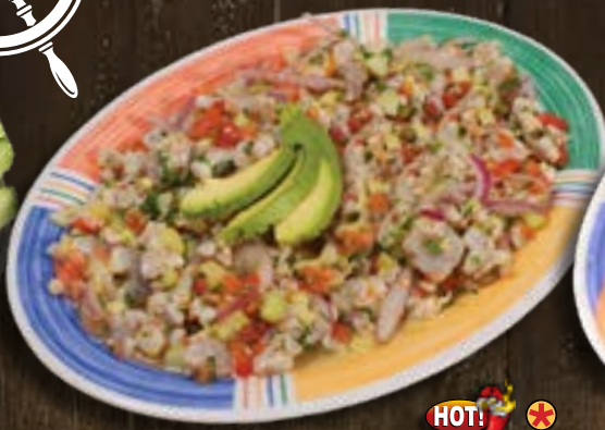
Ceviche de Camarón Pescado o Mixto (spicy) Sm 6 99 • Md 10 99 • Lg 16 49 Fish, shrimp or mix ceviche