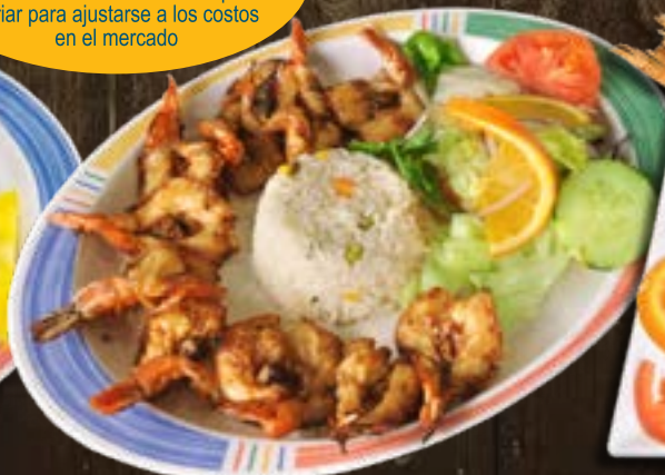
Camarones Zarandeados 19 99 Grilled shrimp with our Nayarit style seasoning (medium spicy)

*MP Prices marked *MP may vary according to the current market Los precios marcados con *MP pueden variar para ajustarse a los costos en el mercado