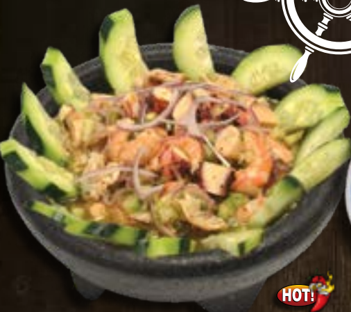
Ceviche Ejecutivo 17 99 Shrimp, octopus and scallops ceviche