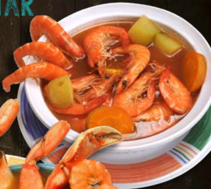
Caldo de Camarón con Cáscara

Caldo Combinación a su Gusto 14 99 Make your own combination (pick 3) • octopus • chopped clam • oysters • tilapia • mussels • shrimp