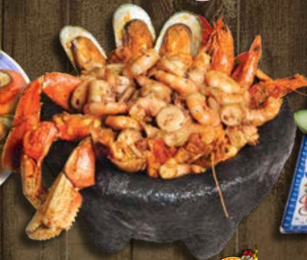
Molcajete Cora 29 99 Shrimp, octopus, mussels, crab legs, surimi, fish and scallops