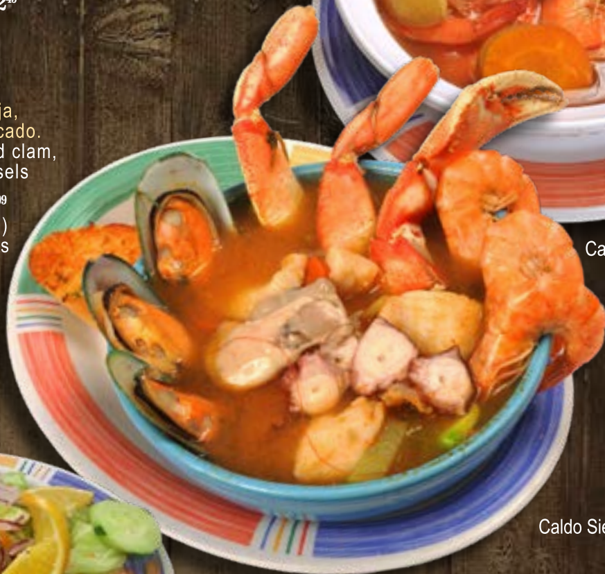
Caldo Siete Mares