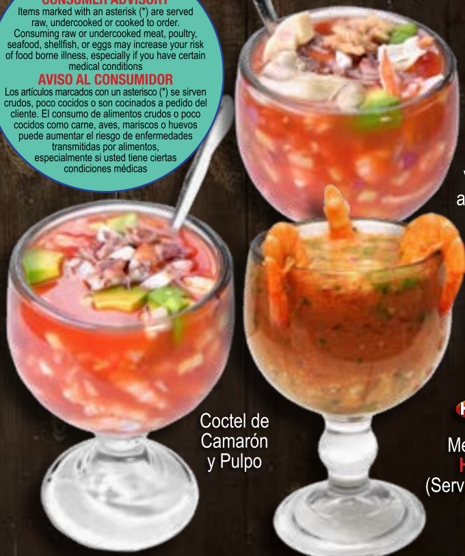
Vuelve a la Vida

Shrimp broth with vegetables, chopped shrimp and octopus & shrimp with peel