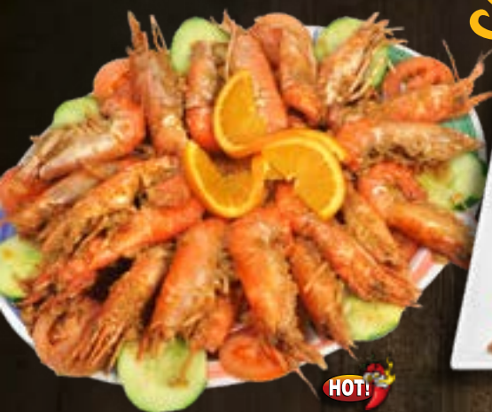
Langostinos Prawns Nayarit style Sm 19 99 • Lg 36 99 *MP