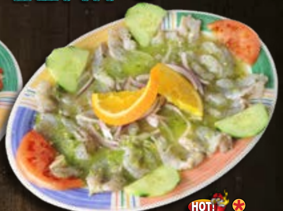
Camarones Aguachile 14 99 Shrimp marinated in fresh lime juice and your choice of green or red sauce