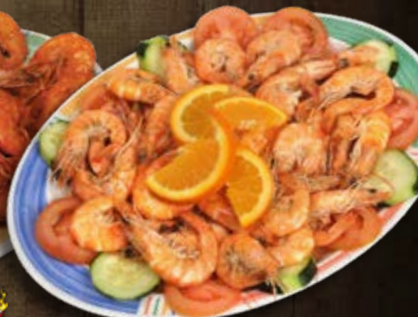
Camarones al Vapor Estilo Nayarit 16 99 Steamed shrimp