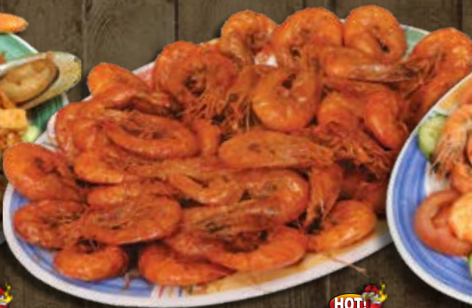
Camarones Cucaracha 19 99 Fried shrimp with hot Huichol sauce. ...deliciously crunchy!