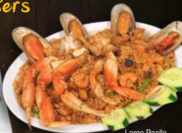
Paella Rice with mixed seafood Sm 21 99 • Lg 36 99 (medium spicy)