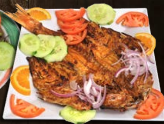
Huachinango Zarandeado *MP MARKET PRICE Grilled red snapper with our special house sauce. Please allow at least 30 minutes for preparation