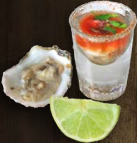
Balazos!!! * Single raw oyster in a shot glass (1) 2 50 • (3) 6 00 • (6) 11 49