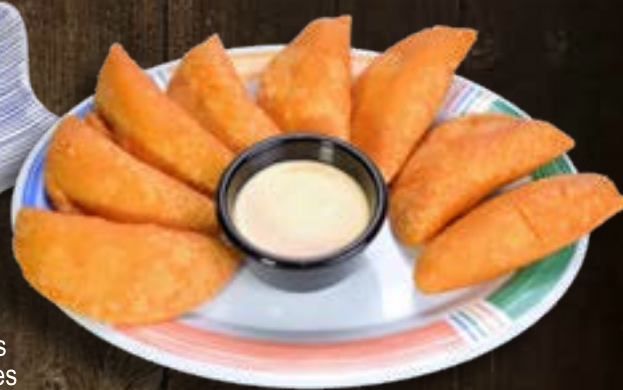
Empanadas de Camarón Shrimp pastries (4) 8 49 • (8) 14 49