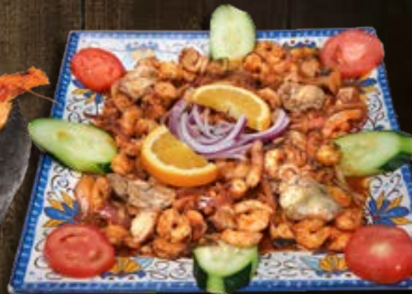
Chapuzon 29 99 Octopus, shrimp and oysters (4)