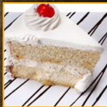
Pastel Tres Leches